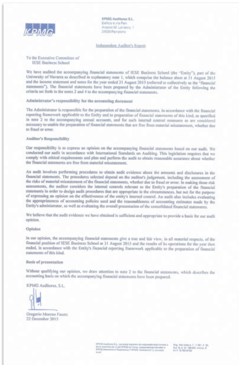
EXHIBIT IV INDEPENDENT AUDITOR'S REPORT